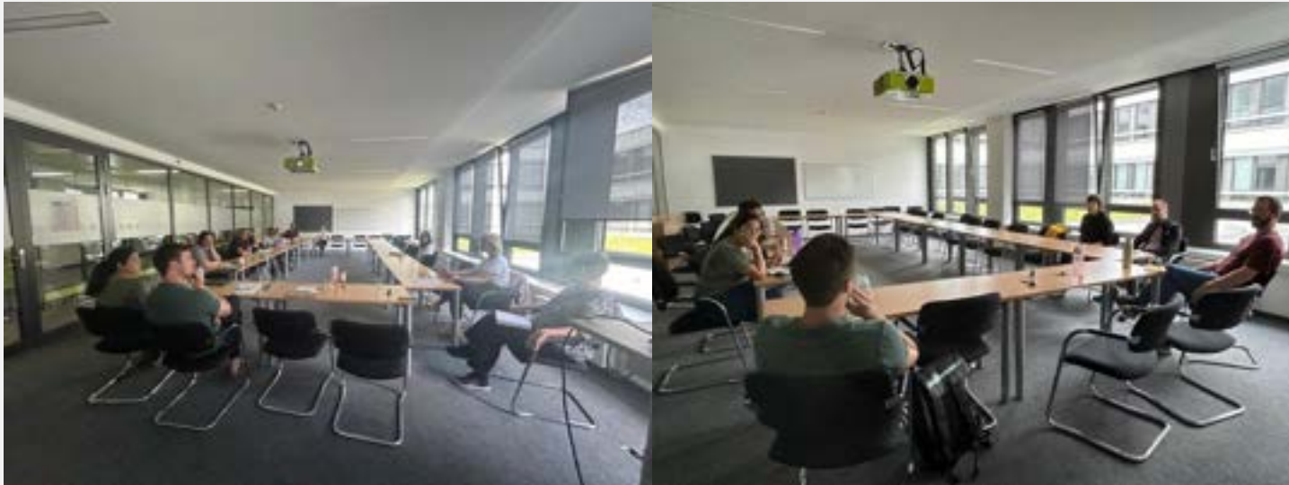
Exchange on teaching